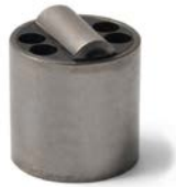
Cp4 Pump Tappet Assy with Roller A2-12000