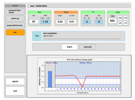
SCV Valve Test Screen